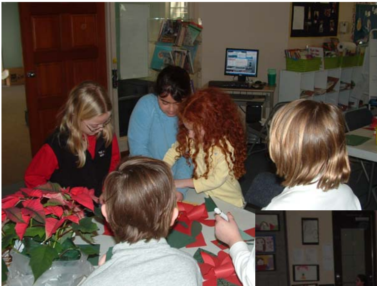
Movie Night...fun at the Polar Express!!