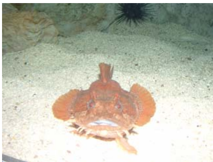
stonefish, shark egg sacs